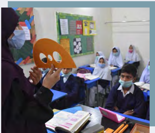
Subject Specific Trainings