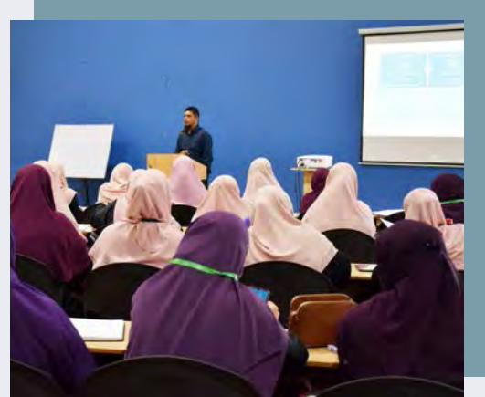
School Leadership Programs