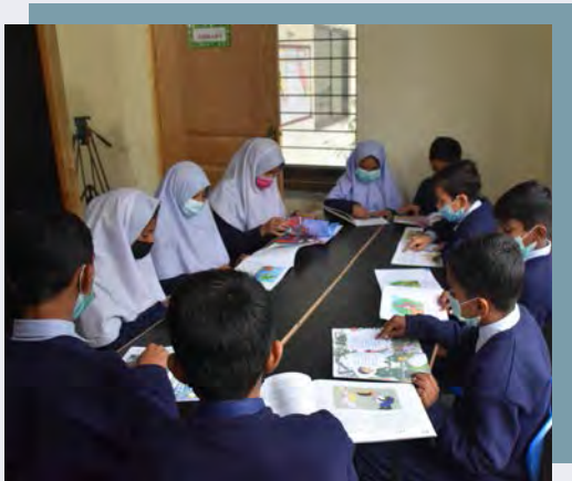
Classroom Management Trainings